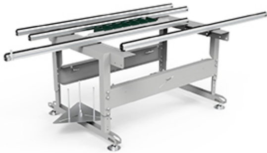
JOB 15 JOB 15 L

Assembly bench with adjustable bars on work table