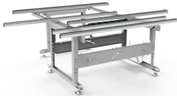
JOB 15 / 2000 JOB 15 / 3000