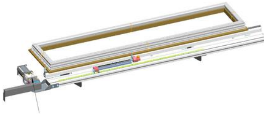
Punching machine optional (*Represented in the image, ZPX14330 punching machine)